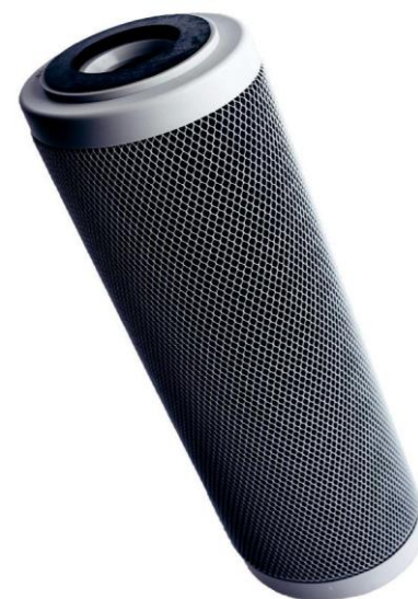
Sintered activated carbon block filter (0.4 \mu\text{m} pore size)

The adsorptive retention rate (ARR) is 120% and the retention capacity (ARK) is 130% compared to Carbonit's NFP Premium cartridge. Therefore, the independent expert opinions prepared for the NFP Premium Cartridge apply without restriction to the GFP Premium Cartridge.